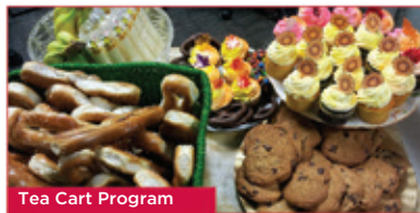
Tea Cart Program